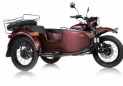
Sidecar + $0.00