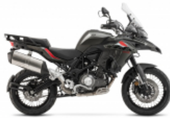
TRK 502 X + $0.00