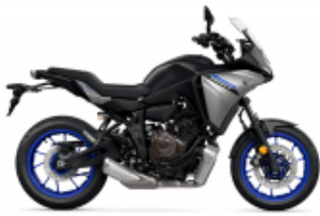
Tracer 700 + $52.13