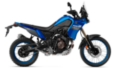
Tenere 700 + $62.56