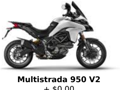
Multistrada 950 V2 + $0.00