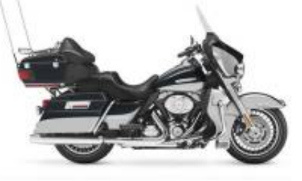
Electra Glide + $0.00