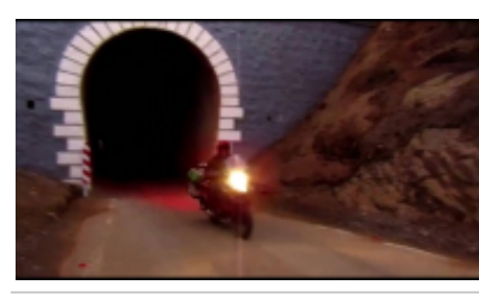
2 - Illapel - Santiago - 290 Return to Santiago by Route 5 with stop in Los Vilos or Pichidangui

1 - Santiago - Illapel - 280 Almost 300 kilometers of driving on slopes and curves in the middle of a foothill landscape going to Illapel.