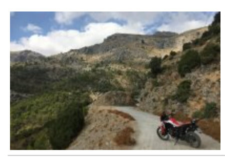
7 - Málaga - Málaga - 0