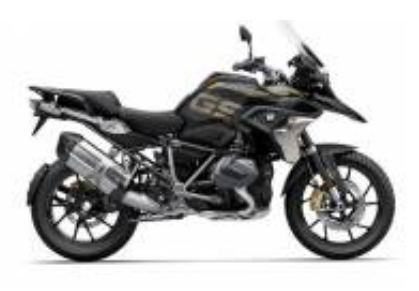
R 1250 GS LC + $790.00