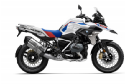
R 1250 GS + $0.00