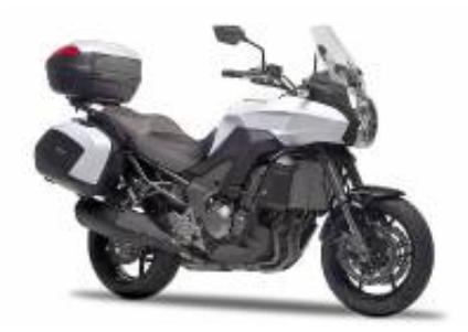
Versys 1000 Grand Tourer + $0.00