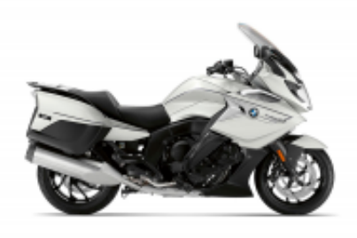
K 1600 GTL + $0.00