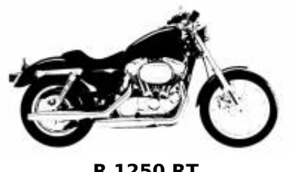
R 1250 RT + $0.00