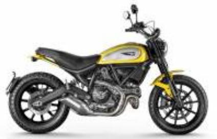
Scrambler Icon 800 + $0.00