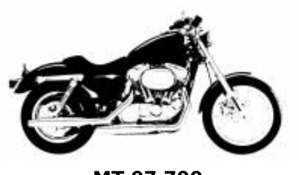
MT 07 700 + $0.00