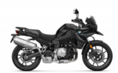
F 750 GS + $0.00