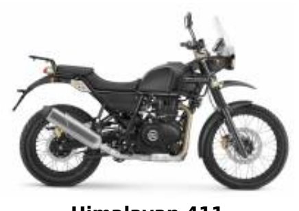
Himalayan 411 + $0.00