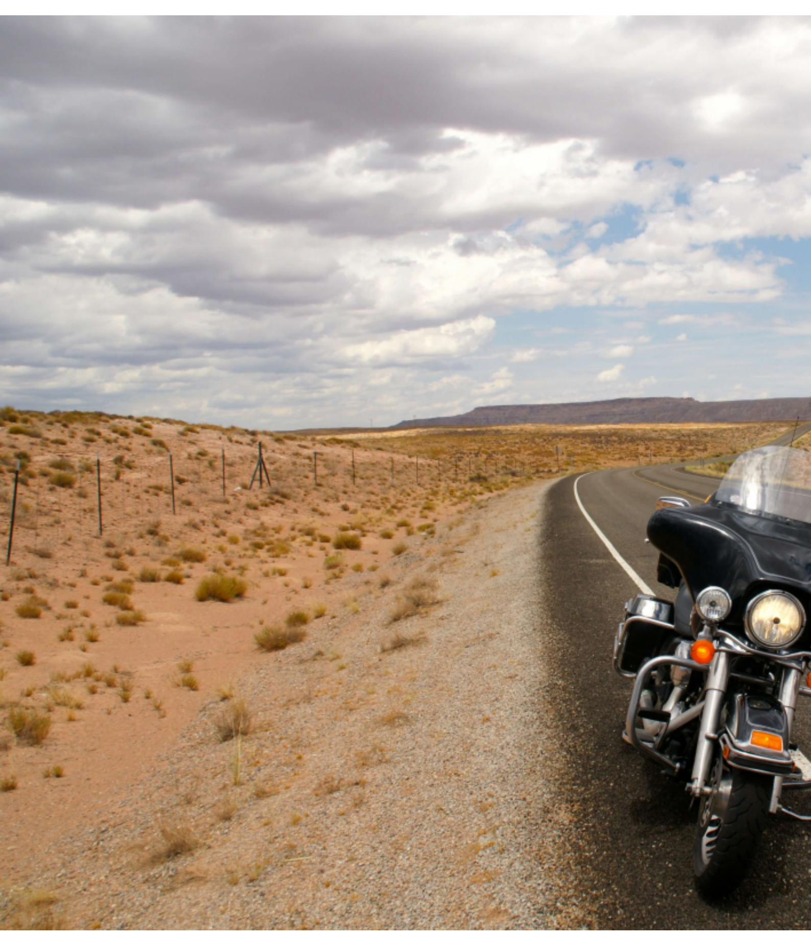
Motorcycle touring and cruiser tour wild west II from Las Vegas to Los Angeles. Guided