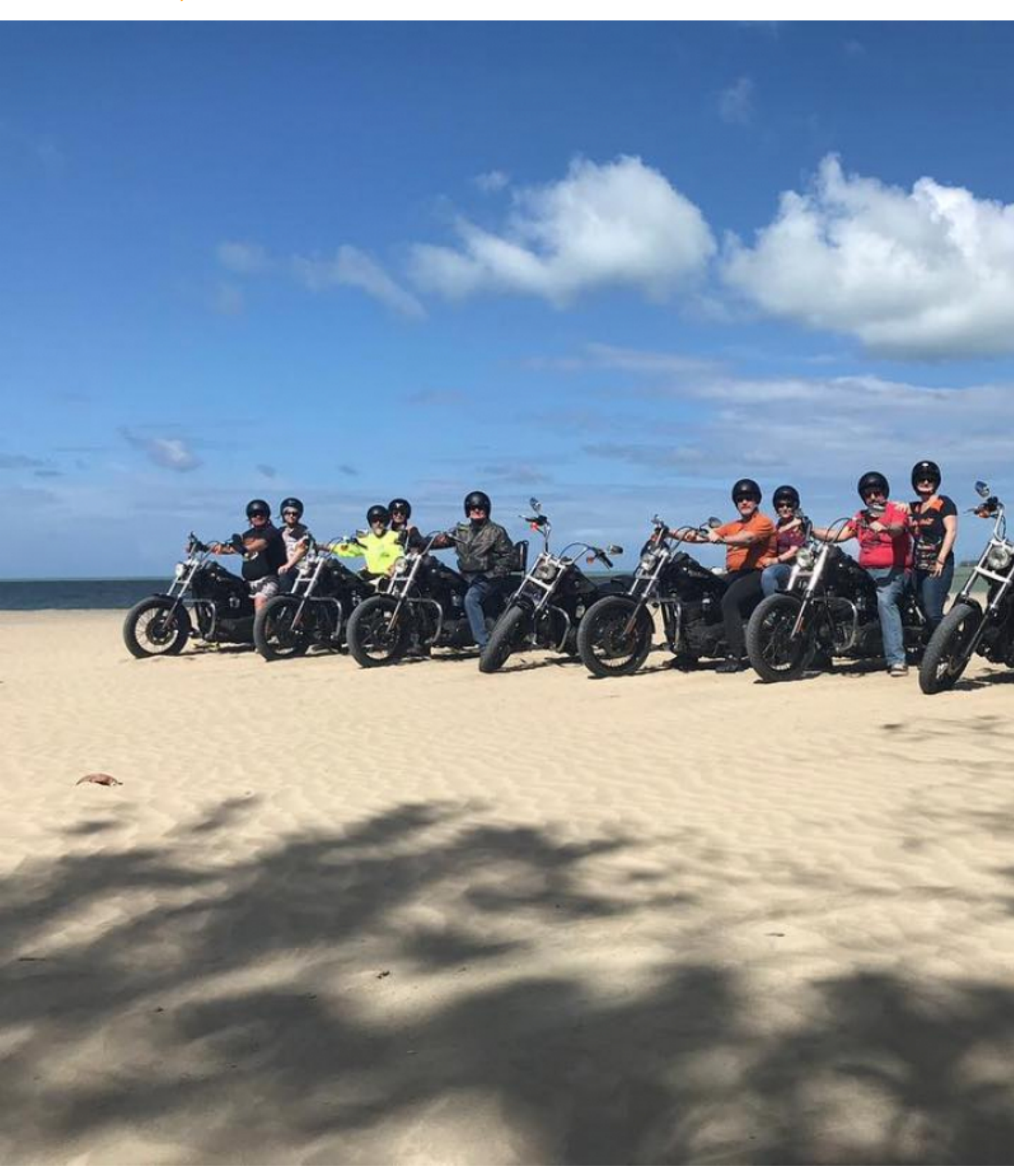
Motorcycle touring and cruiser tour, Dominican Republic