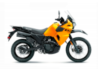
KLR 650 + $165.32