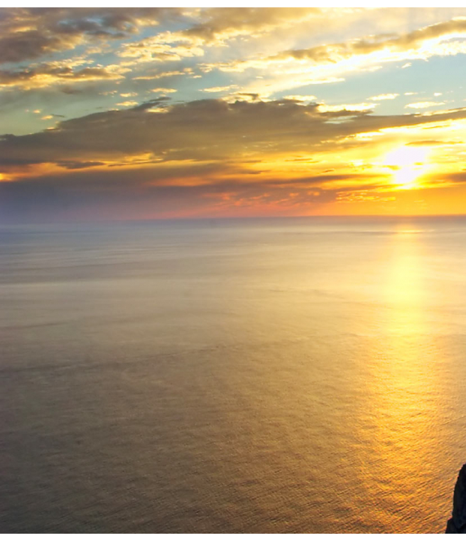
Motorcycle dual-purpose and Adventure North Cape from Oslo