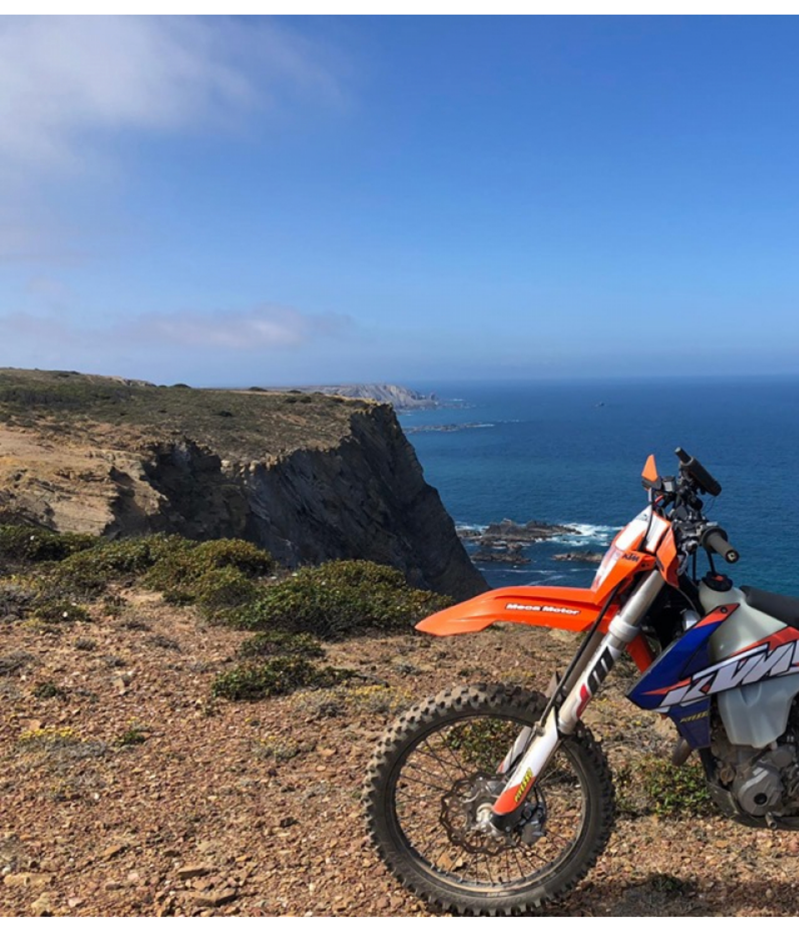
Motorcycle Enduro off Road tour South Portugal, Algarve