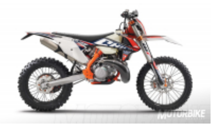
300 2T six days + $0.00