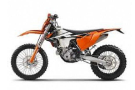
EXC 350 + $0.00