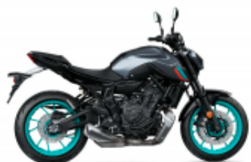
MT 07 700 (A2) + $0.00