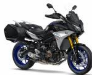
MT 09 847 + $446.50