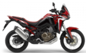
Africa Twin CRF 1100 L + $446.50