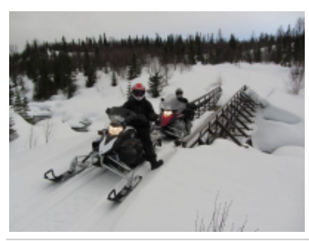
2 - Albacken - Albacken -