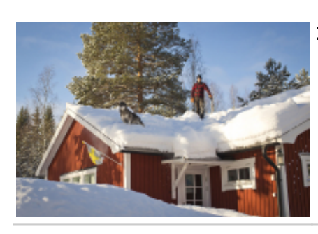
1 - - Albacken -