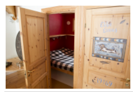
3 - Albacken - Albacken -