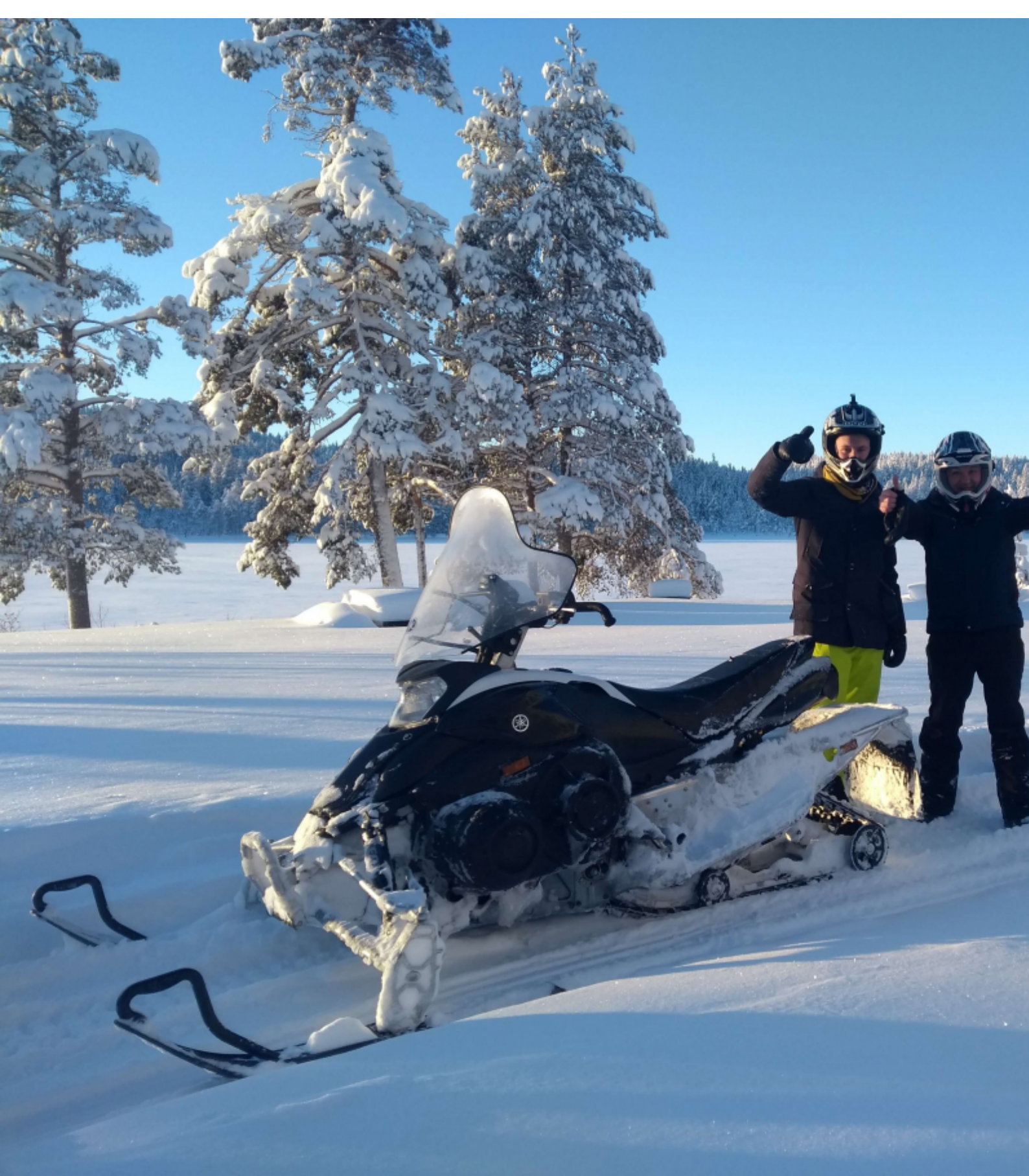
Snowmobile tour multi adventure Sweden