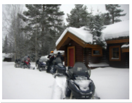
6 - Albacken - -