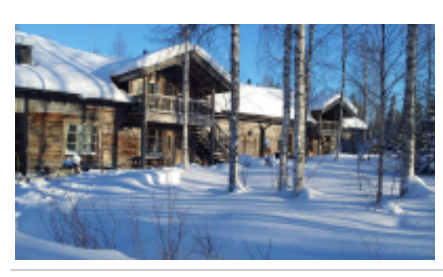
5 - Albacken - Albacken -