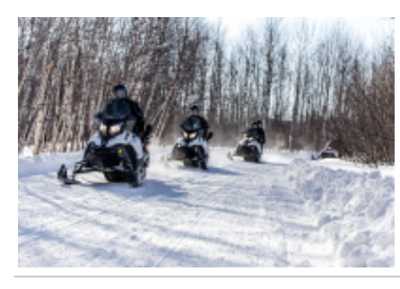
4 - Albacken - Albacken -