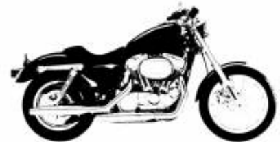
R 18 Transcontinental + $629.45