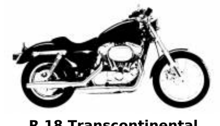
R 18 Transcontinental + $660.74