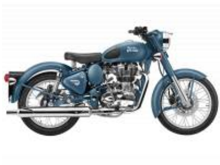
Squadron Blue 500 + $0.00