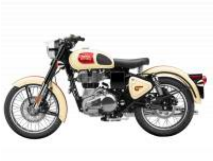
Tan 350 + $0.00