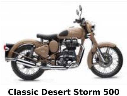
Classic Desert Storm 500 + $0.00