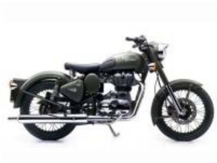
Military 500 + $0.00