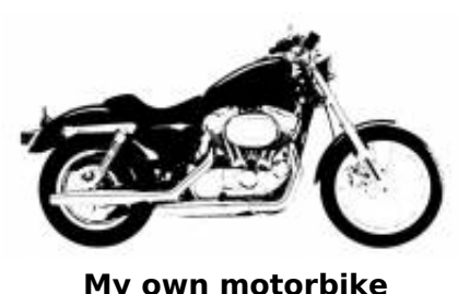
My own motorbike + $0.00