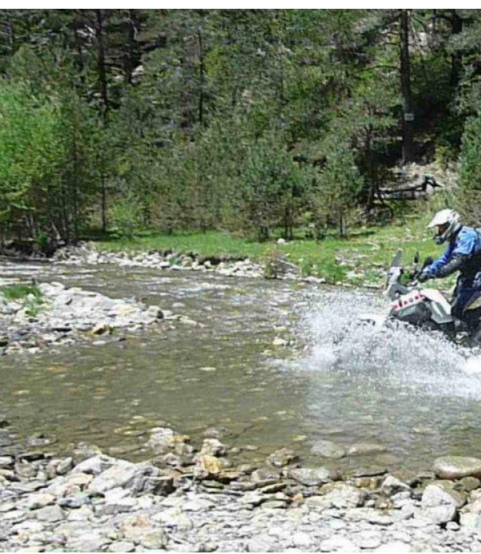
Motorcycle Enduro off Road tour Nomad Enduro off Road Valencia