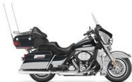
Road Glide Ultra Grand Touring Class + $700.00