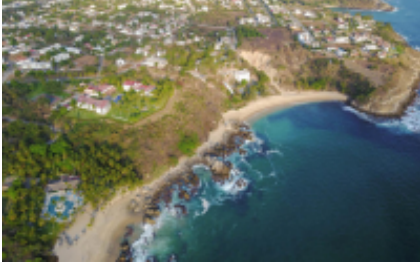
9 - Guanajuato - San Miguel de Allende - Guanajuato – San Miguel Allende