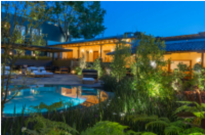
11 - Santiago de Querétaro - Querétaro Intercontinental Airport - Querétaro – Airport (van)