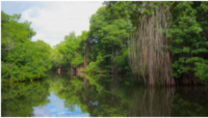
10 - San Miguel de Allende - Santiago de Querétaro - San Miguel Allende – Querataro