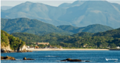
8 - Zacatecas - Guanajuato - Zacatecas – Guanajuato