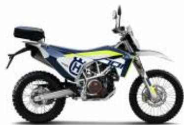
701 Enduro + $0.00