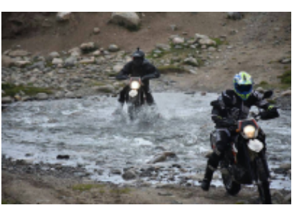
Deep canyons ride Sunrise coffee from the Ramon Crater Crater Sliding Water Oasis Egyptian border ride Grand rivers reserve ride Deep canyons ride