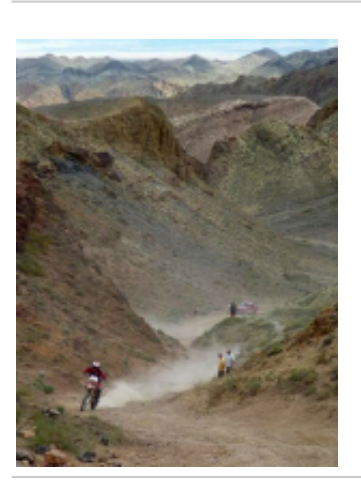
The spectacular Ramon Crater Desert Enduro ride through deep narrow canyons Ramon Crater views from above and cliff ride Chillout night at a traditional Beduin "Khan" Desert Hosting