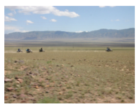
3 - - - Deep into the Bible Land Climbing the Copies Cliff and delve into the Judean Desert Breathtaking views from the Dead Sea Chillout night at a traditional Beduin "Khan" Desert Hosting