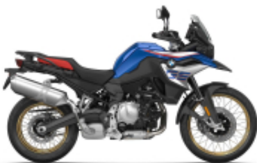
F 850 GS + $219.19