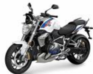
R 1250 R + $438.38