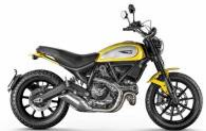
Scrambler Icon 800 + $219.19