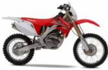
CRF 250 + $0.00