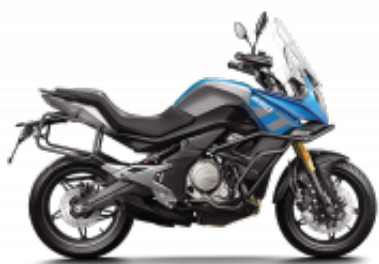
650MT 2022 + $1,164.38