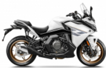
650GT + $1,164.38