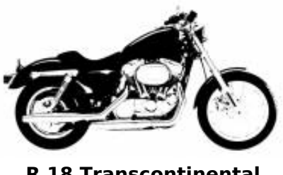
R 18 Transcontinental + $0.00