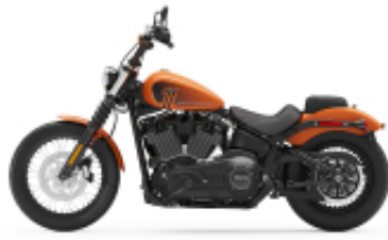
Street Bob + $0.00