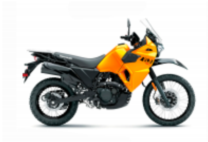
KLR 650 + $156.97