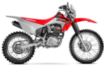
XR 250 Tornado + $0.00