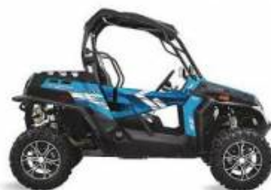
CF MOTO Z-FORCE EX 4x4 + $647.27