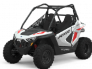
RZR 700 + $647.27