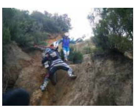
5 - Sibiu - Sibiu - 130