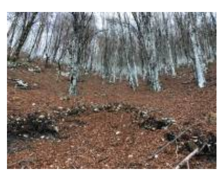
6 - Sibiu - - 0