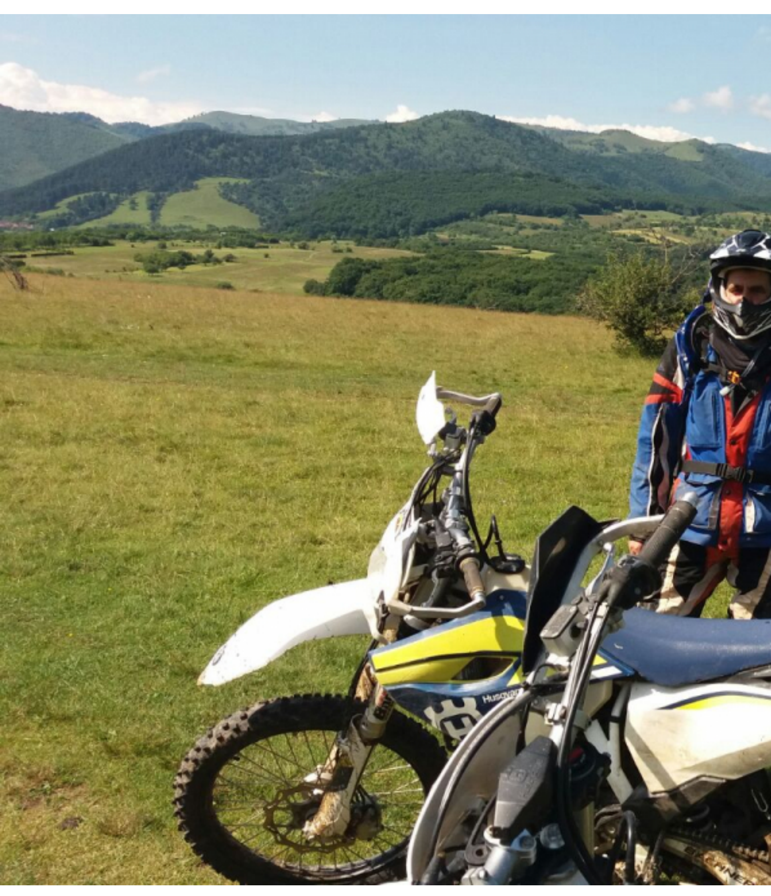
Motorcycle Enduro off Road Romania Enduro off Road short