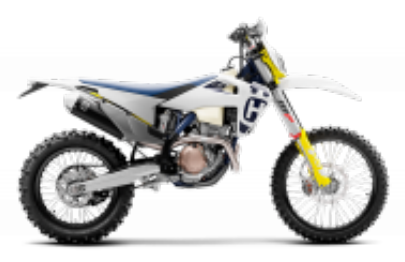
FE 350 + $0.00