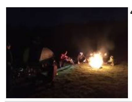
4 - Sibiu - Sibiu - 150