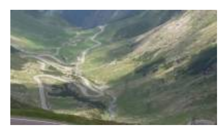
3 - Sibiu - Sibiu - 90