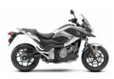
NC 750 X + $0.00