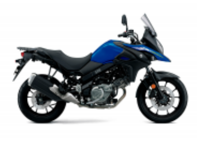
V-STROM 650 + $0.00