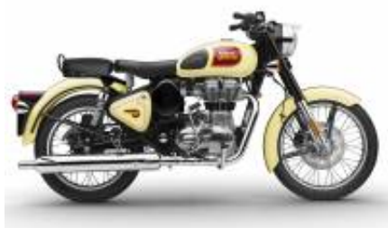
Classic 500 + $52.32