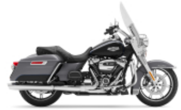
Road King Street Classic Class + $627.88