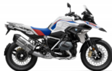
R 1250 GS + $520.26