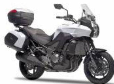
Versys 1000 Grand Tourer + $520.26