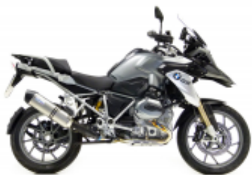
R 1200 GS LC + $796.27