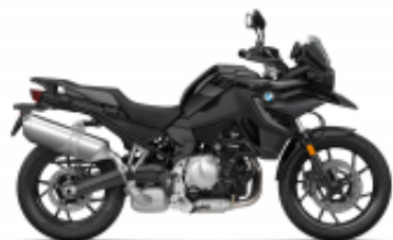
F 750 GS + $796.27