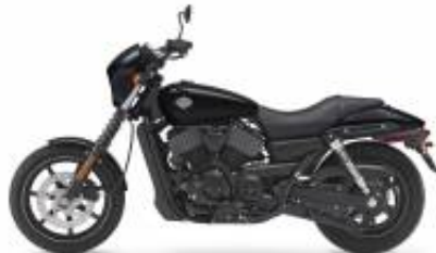
Street 750 + $0.00