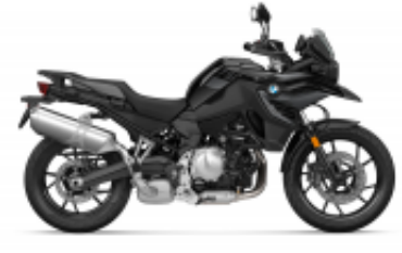
F 750 GS + $0.00