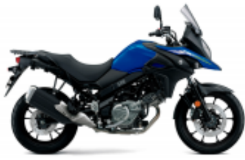
V-STROM 650 + $0.00