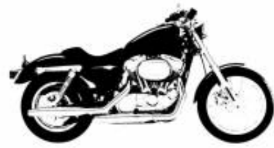
My own motorbike + $0.00