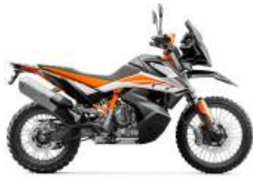
790 Adventure + $470.91