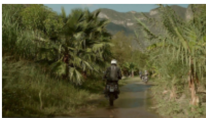
6 - Sayulita - Tlaquepaque - Sayulita - Tlaquepaque