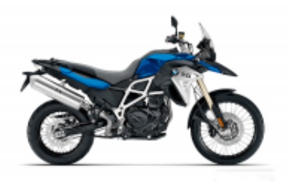
F 800 GS + $1,350.00