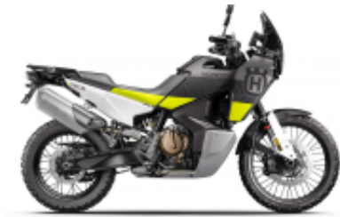
Norden 901 + $0.00