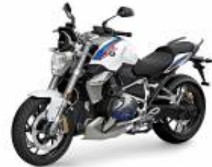
R 1250 R + $442.37