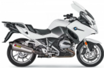
R 1200 RT + $442.37