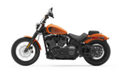
Street Bob + $0.00