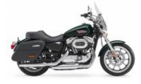
Superlow 1200 T + $0.00