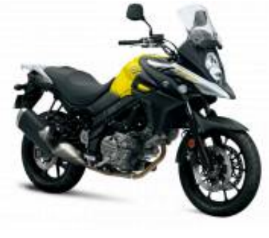
DL 650 V Strom + $0.00