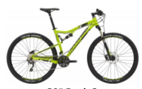
29" Rush 2 + $35.07