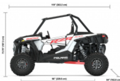
RZR 1000 XP + $0.00