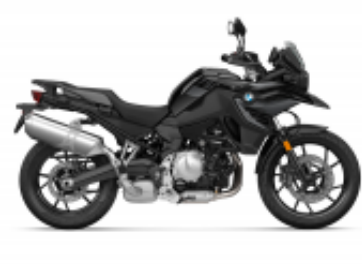
F 750 GS + 0.00.-