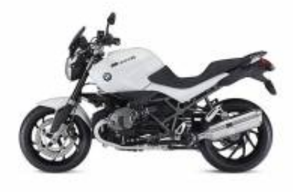
R 1200 R + $98.72